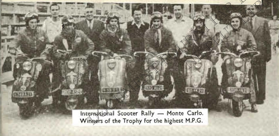
International Scooter Rally — Monte Carlo. Winners of the Trophy for the highest M.P.G.